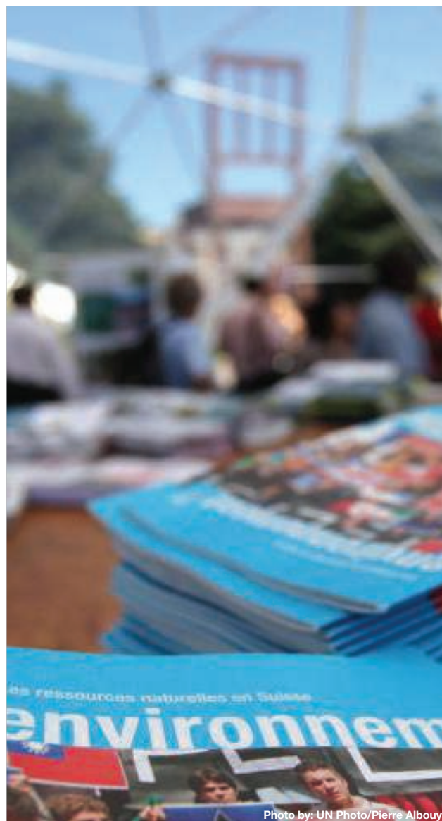
World Environment Day, Place des Nations, 2010.

19 Second, States should provide affordable, effective and timely access to environmental information held by public authorities, upon the request of any person or association, without the need to show a legal or other interest. Grounds for refusal of a request should be set out clearly and construed narrowly, in light of the public interest in favour of disclosure. States should also provide guidance to the public on how to obtain environmental information.