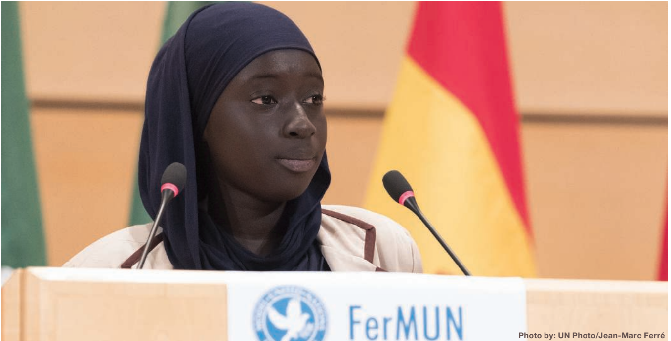
Representative of Lycee Demba Diop Mbour of Senegal during FerMUN 2018, 10 January 2018.

States should provide for education and public awareness on environmental matters.