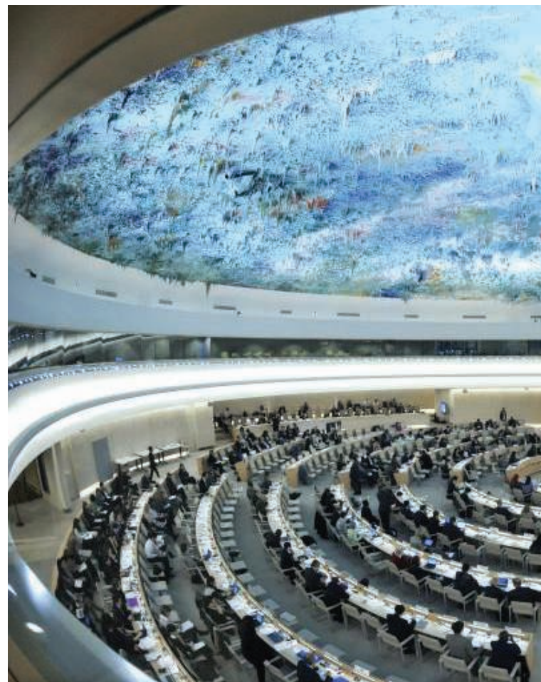
16th Session of the Human Rights Council, 2011.