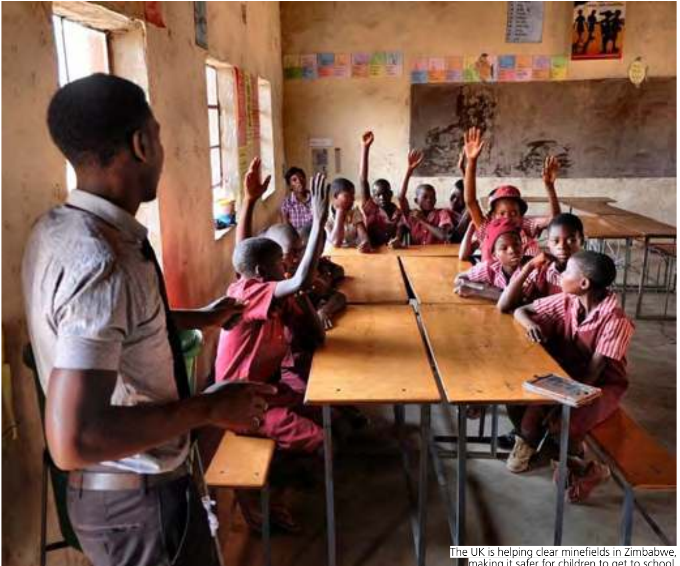
The UK is helping clear minefields in Zimbabwe, making it safer for children to get to school.

during the eviction of villagers from a farm seized by former First Lady, Grace Mugabe.