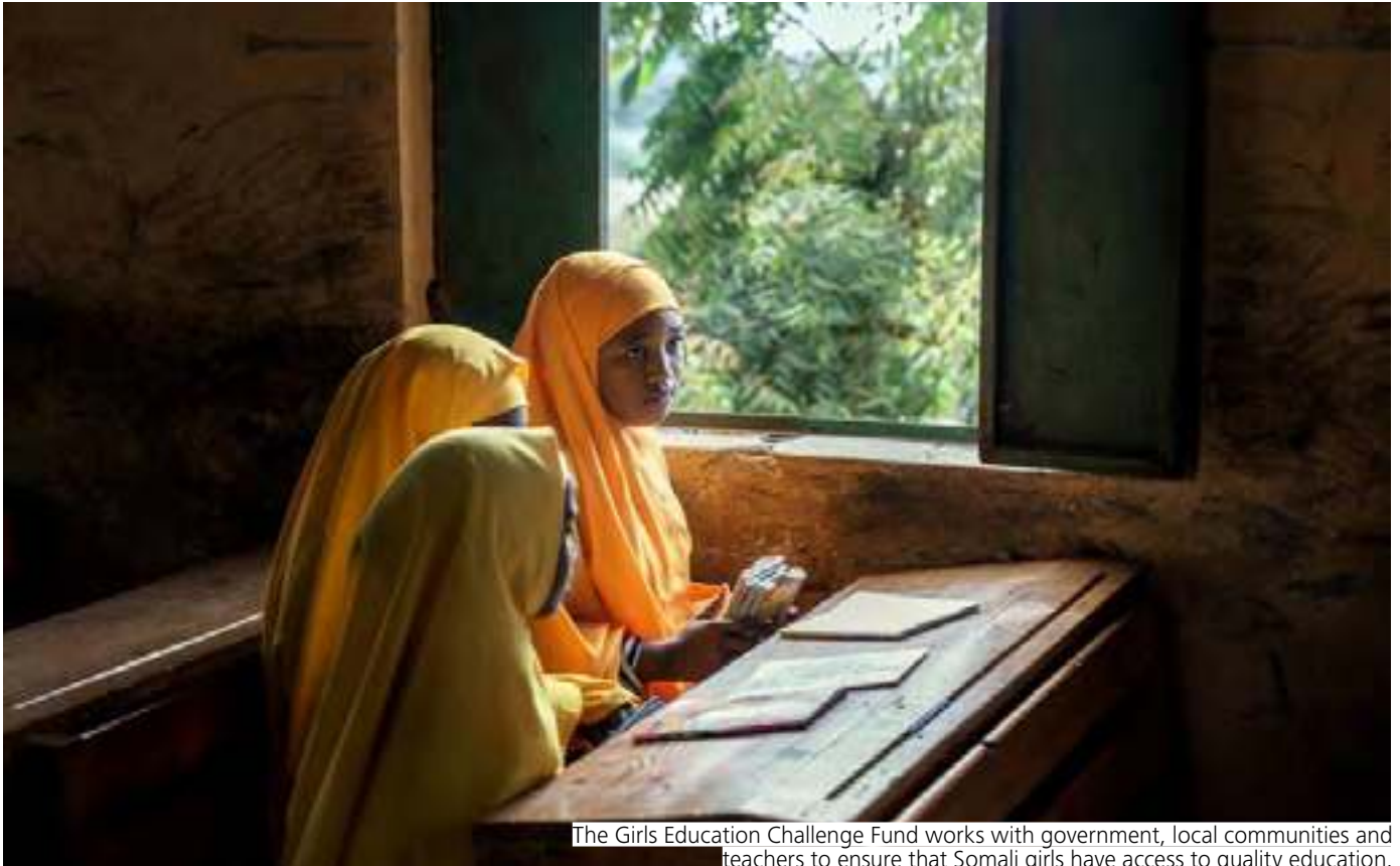
The Girls Education Challenge Fund works with government, local communities and teachers to ensure that Somali girls have access to quality education.

We want to break down the barriers preventing girls from gaining 12 years of quality education, improving the quality of teaching, supporting the reform of education systems and helping the most marginalised girls to learn.