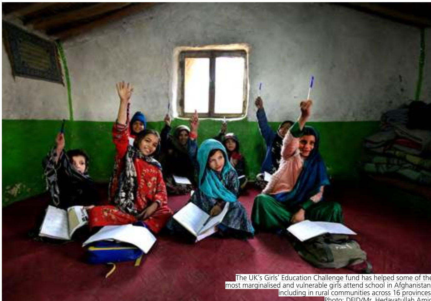
The UK's Girls' Education Challenge fund has helped some of the most marginalised and vulnerable girls attend school in Afghanistan, including in rural communities across 16 provinces.