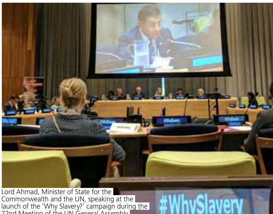
Lord Ahmad, Minister of State for the Commonwealth and the UN, speaking at the launch of the 'Why Slavery?' campaign during the 72nd Meeting of the UN General Assembly.

The UK was instrumental in ensuring that the HRC renewed the mandate of the Commission of Inquiry on Burundi . The resolution passed with overwhelming support, including from Botswana and Rwanda, coming on top of an African Group-led resolution where Burundi publicly pledged to cooperate with OHCHR.