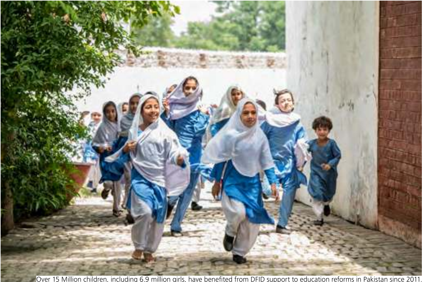
Over 15 Million children, including 6.9 million girls, have benefited from DFID support to education reforms in Pakistan since 2011.

fair presidential elections scheduled for 2018. The UK will continue through public and private messaging to make clear to the Government of Maldives our concerns over the erosion of democracy and human rights.