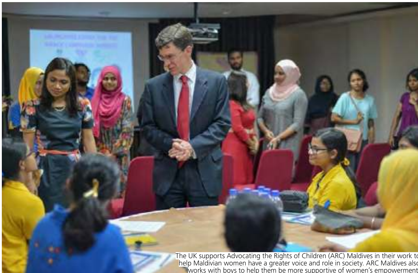
The UK supports Advocating the Rights of Children (ARC) Maldives in their work to help Maldivian women have a greater voice and role in society. ARC Maldives also works with boys to help them be more supportive of women's empowerment.

from meeting representatives of international organisations and diplomats without central government permission.