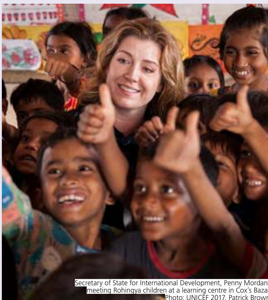
Secretary of State for International Development, Penny Mordant meeting Rohingya children at a learning centre in Cox's Bazar

The FCO is working closely with DFID on this priority issue. Reproductive rights are central to women and girls' empowerment. In 2017, the UK hosted the Family Planning Summit, which reaffirmed a global commitment to voluntary, rights-based family planning. At the Summit, 36 countries made new commitments or expanded existing ones. The UK committed to spend £1.1 billion in this area over five years. This will support contraceptive use by nearly 20 million people, and will prevent more than an estimated three million abortions – many of