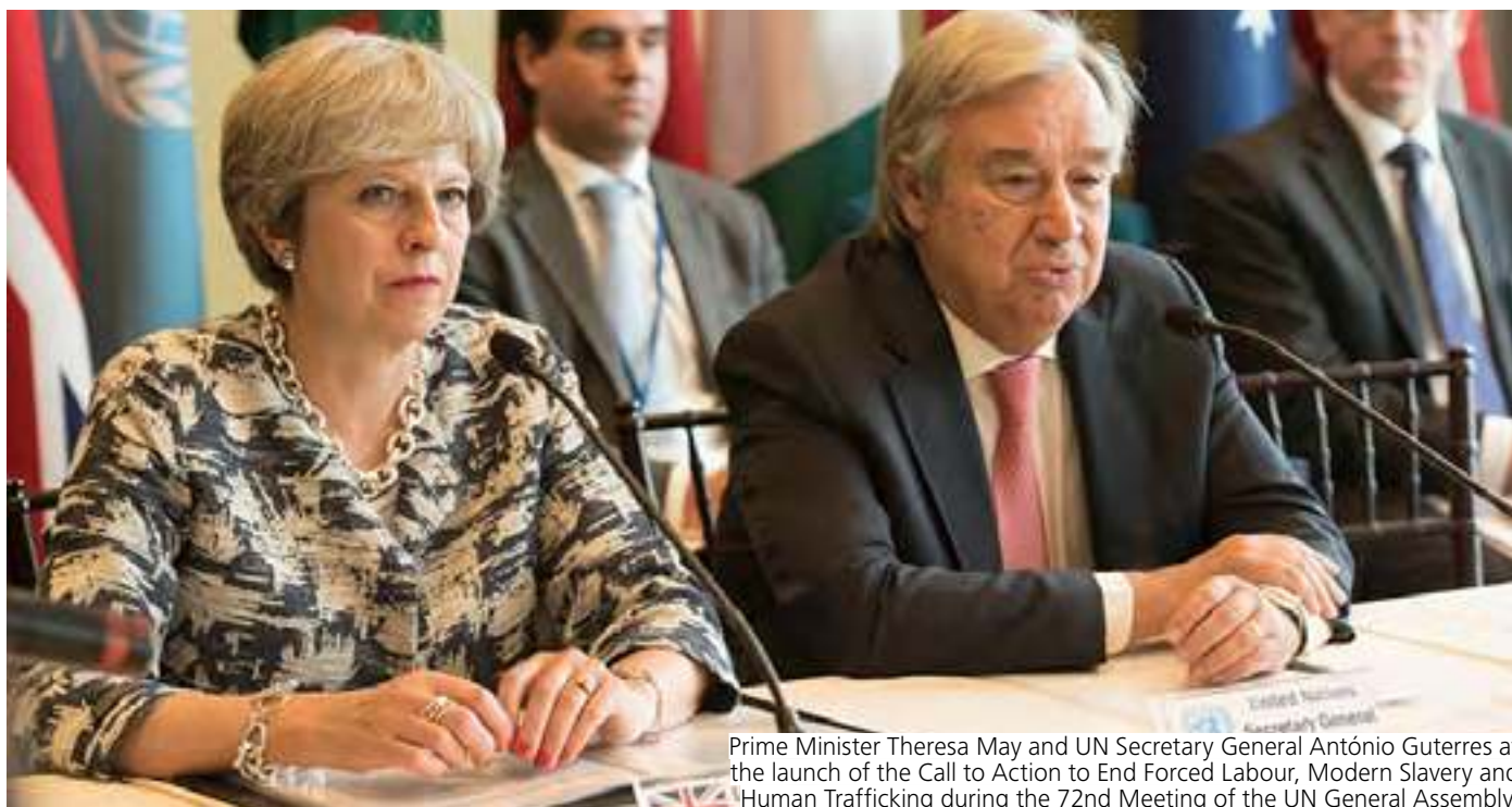
Prime Minister Theresa May and UN Secretary General António Guterres at the launch of the Call to Action to End Forced Labour, Modern Slavery and Human Trafficking during the 72nd Meeting of the UN General Assembly.

the UK provided specialised training to prosecutors and police officers dealing with human trafficking victims. In Venezuela , the UK funded a modern slavery diagnostic study, and promoted the creation of a multidisciplinary working group on modern slavery. During Lord Ahmad's visit to Ghana , he explored a new commitment to making progress on an Action Plan to eliminate human trafficking with the Minister for Gender. The 2017 UK Annual Report on Modern Slavery [13] provides further detail on how the UK has responded to this issue.