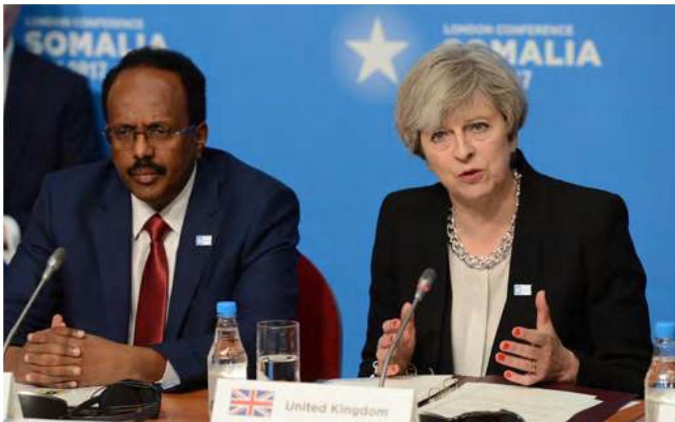
Prime Minister Theresa May and President Farmajo of the Federal Government of Somalia at the London Somalia Conference, 11 May 2017. Theresa May gave a speech about the importance of building a stable and prosperous future for Somalia.