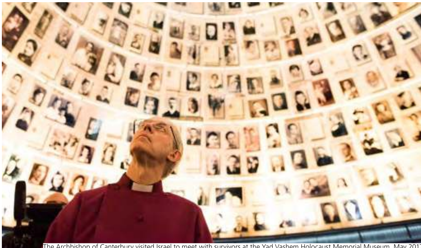
The Archbishop of Canterbury visited Israel to meet with survivors at the Yad Vashem Holocaust Memorial Museum, May 2017.