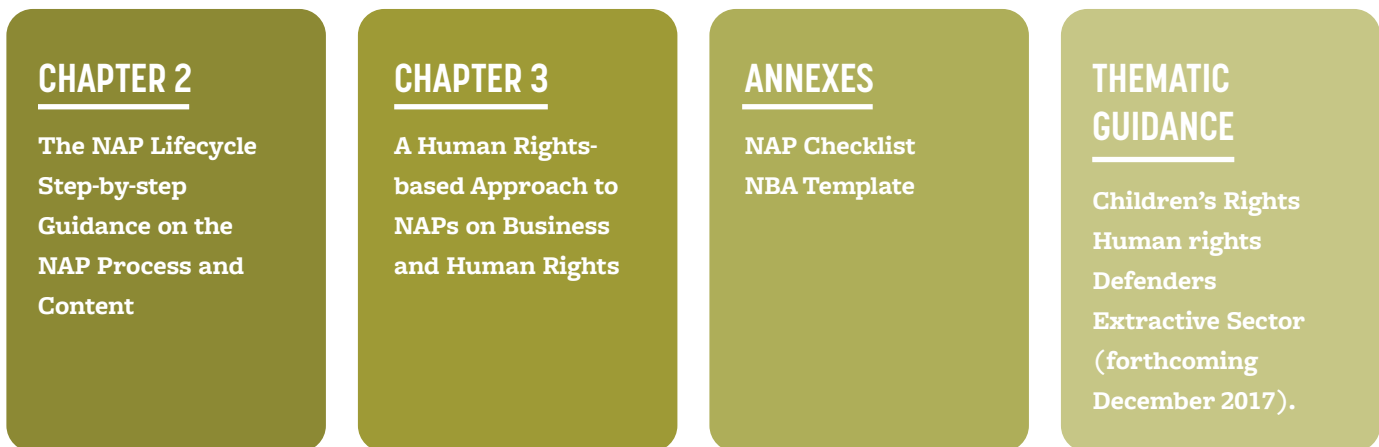
DIAGRAM 1: STRUCTURE OF THE NAPs TOOLKIT